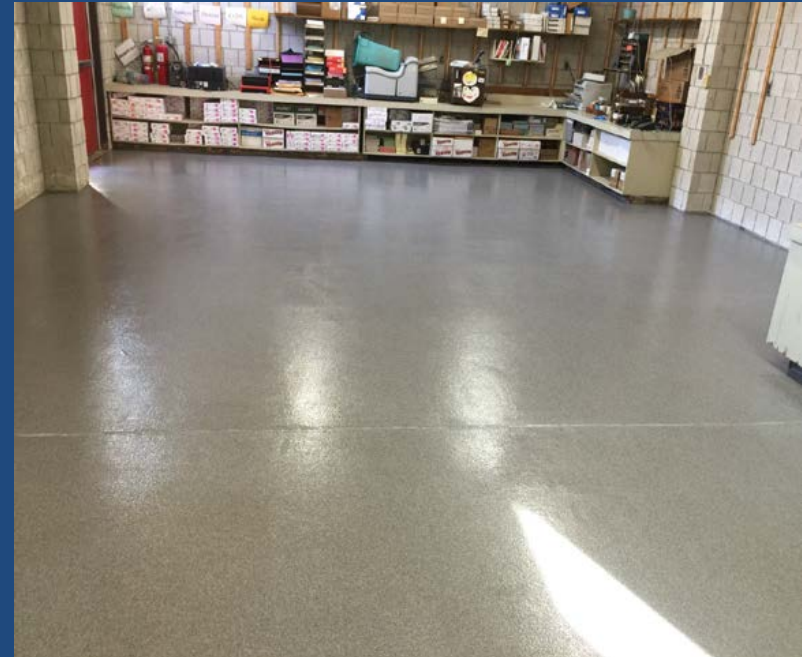
Ripley Copy Center Asbestos Flooring Replacement