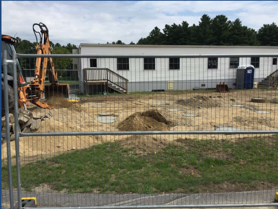
Sanborn Modular Classrooms Installed