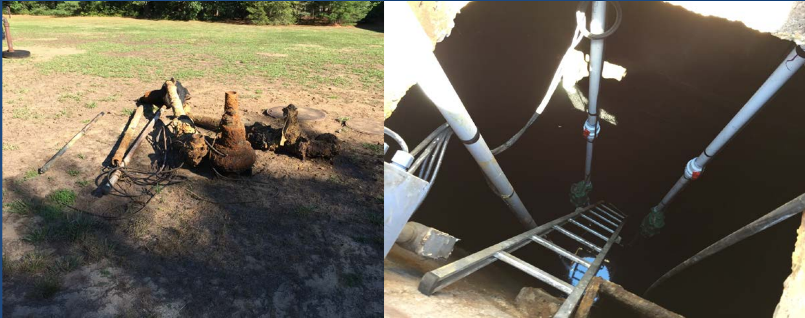
Sanborn Sewer Ejector Pump