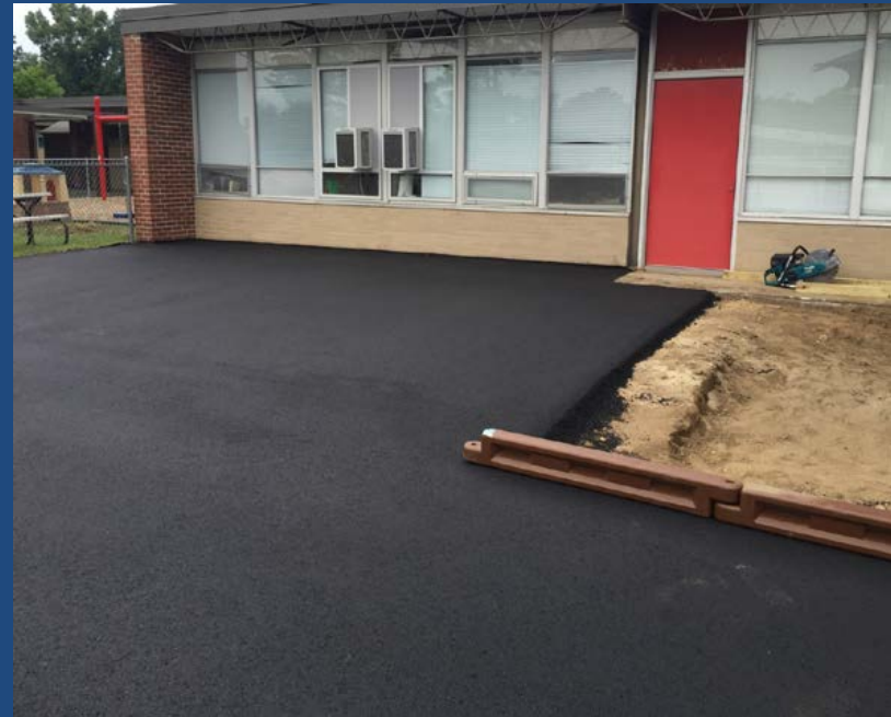
Ripley Preschool Playground Area